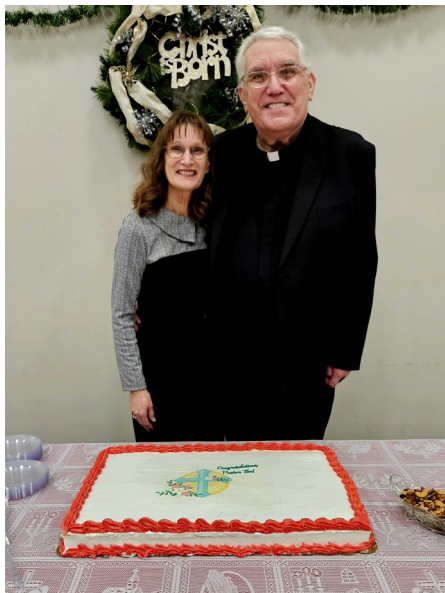
Installation December 15th